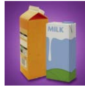
Printed carton board