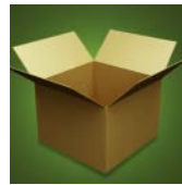
Unprinted carton board